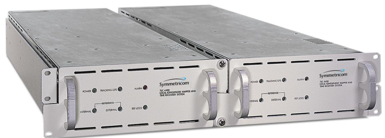
TSC 4400 GPS Disciplined Rb Oscillator

Please contact Symmetricom with any specific requirements.